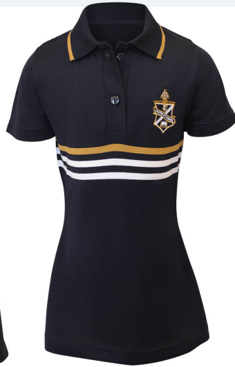
POLO DRESS Sits approx. to knee (poly/cotton)