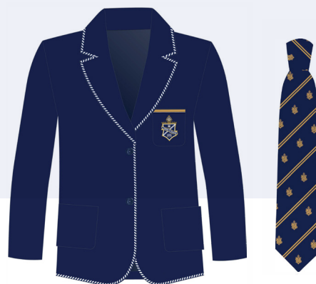
VCE 'GOLD' POCKET BRAID AND TIE