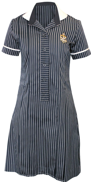
DRESS (F-Year 12)