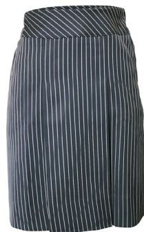
SKIRT (Years 5–12)