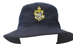
BUCKET HAT (compulsory)