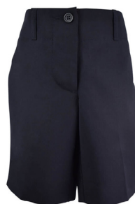
NAVY SHORTS (Relaxed & Tailored options)