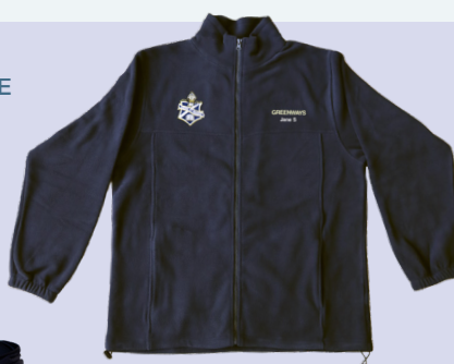
GREENWAYS POLARFLEECE JACKET (Compulsory Year 9)