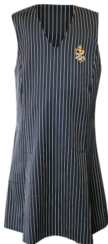
TUNIC (F-Year 4*)

Choose at least ONE of the following items + MG navy socks (or navy tights)