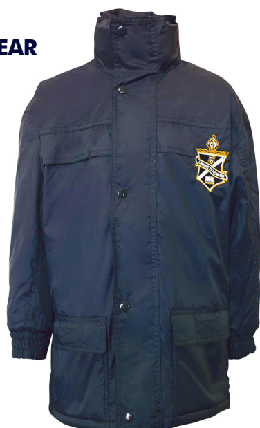
RAINCOAT (F-Year 6)