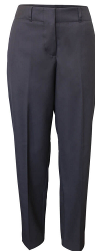
NAVY PANT (Relaxed & Tailored options)