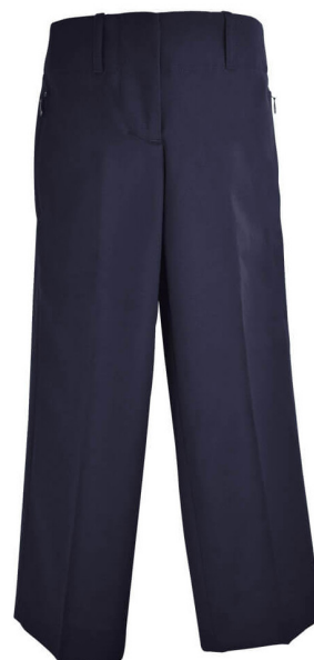
NAVY PANT Double Knee (F-Year 4) Tailored or Classic (Years 5–12)