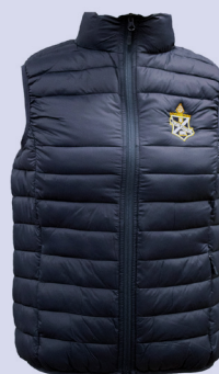
PUFFER VEST (F-Year 12)