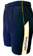
PE SHORTS (Classic or Tailored)