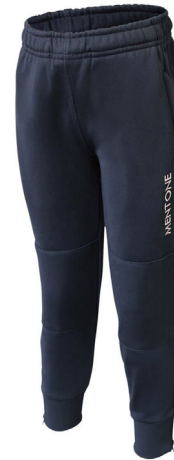
ENDURANCE TRACKPANTS (Reinforced knee)