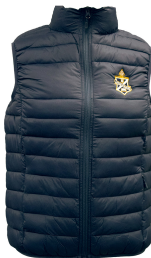
PUFFER VEST (F-Year 12)