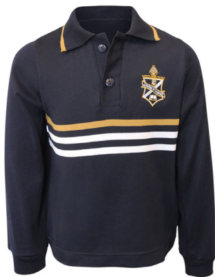
QUARTER ZIP SPORTS TOP