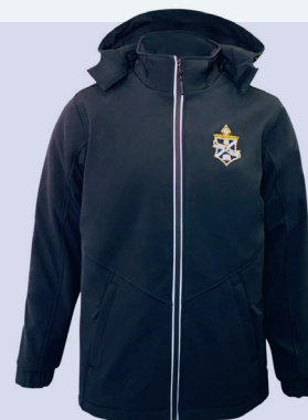
OUTER PREMIUM QUILTED COAT (LONG-LINE) (Year 5-12)