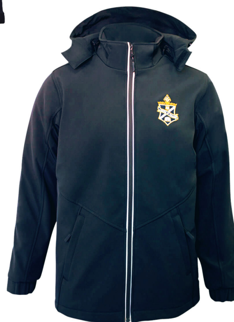
OUTER PREMIUM QUILTED COAT (LONG-LINE) (Years 5-12)