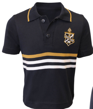
PE POLO TOP Short & Long sleeve options (poly/cotton)